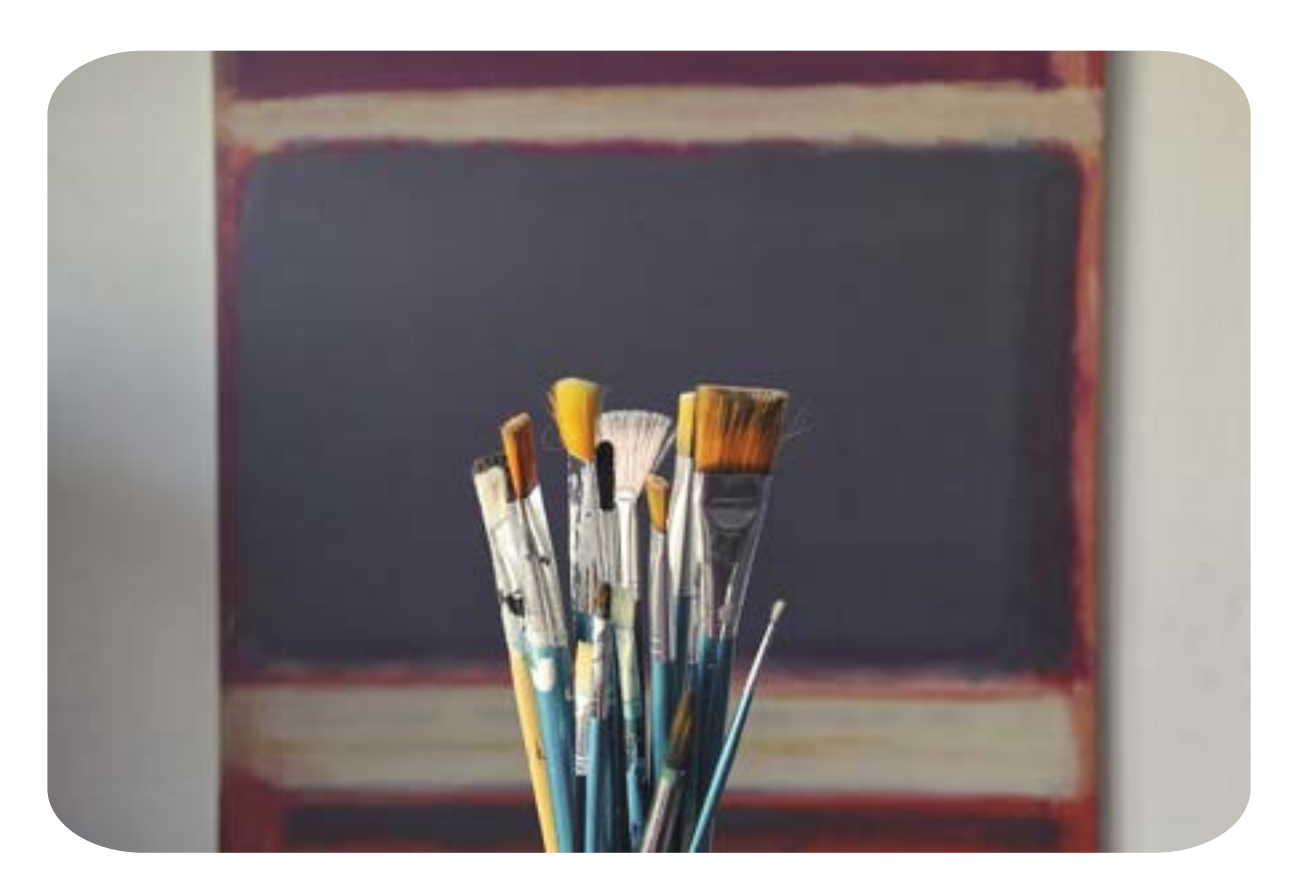
Art Show Update

Things are progressing well with planning for the Art for Scholarships Art Show on Friday, March 31. We've heard from a few artists after the Call of Artists went out and will continue to follow up on new suggestions. The Sponsor Outreach Team is busy seeking sponsors and donations.